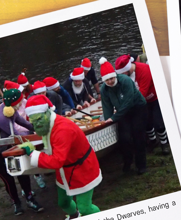
The Grinch, Snow White and the Dwarves, having a cracking festival paddle! #idbf30 #dragonboat @3RiverSerpents