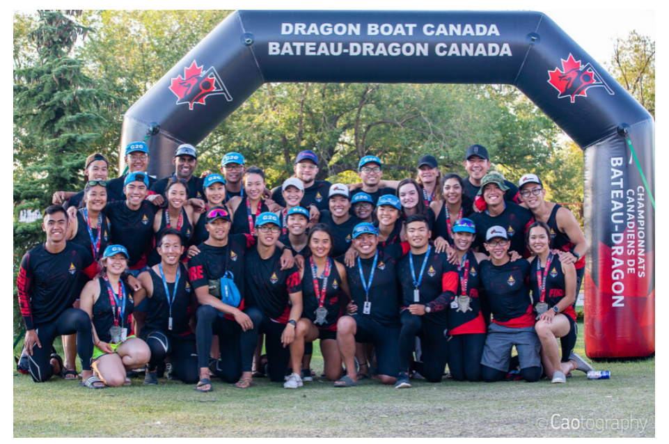
Firetruck Team at 2019 Canadian Nationals.

Firetruck Dragon Boat was founded in 2017, after a long history as the University of British Columbia's (UBC) dragon boat team (since 2012) as a way to retain its paddlers post university life. The name "Firetruck" has always been an attention grabber that started off as a joke, which became an identity. "Firetruck" represents a family that comes from diverse backgrounds, always caring and looking out for one another, helping each other achieve their personal goals and take down barriers together. This familv includes the teams' current members and its alumni. As the team captain would say, "once in the team, forever in the family."