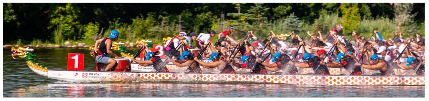
200 Semi-final at 2019 Canadian Nationals.

As a part of the lead up to CCWC in 2020, Long Zhou will be regularly featuring clubs in each issue. If you would like your club to be featured, please email us your club's story and photos to: idbfnews@dragonboat.sport