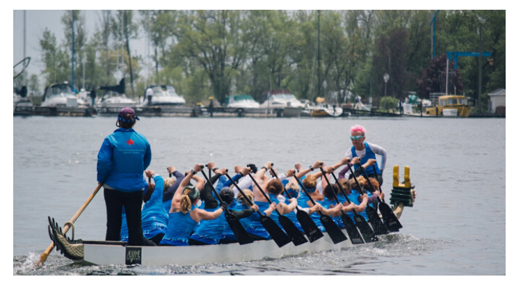
TNSW Team.

True North Senior Women (TNSW): Formerly known as Outer Harbour Senior Women and Toronto Women, TNSW is Toronto's world-class dragon boat team for women 39+ years of age. Founded in 2003, they are a competitive team of high-performance female athletes committed to competing from local to international competitions. This team are no strangers to international wins as they have podiumed at six Club Crew World Championships including a clean sweep in Italy in 2014 and have been producing senior national team athletes since inception.