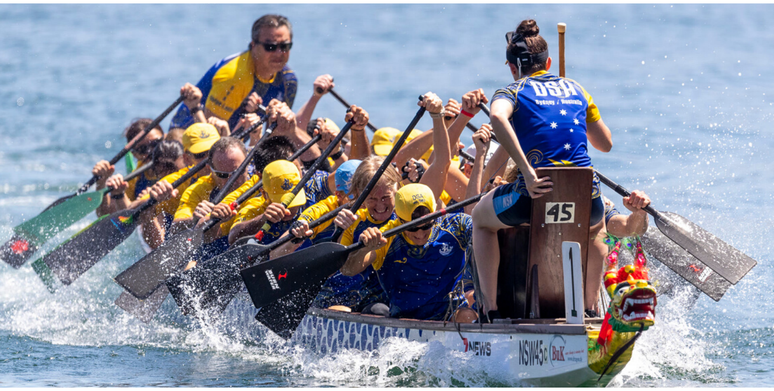
Cover photo: DSA (Sydney, Australia) - Senior B Mixed Crew at the 2020 City of Sydney Lunar New Year Dragon Boat Races, Darling Harbour.