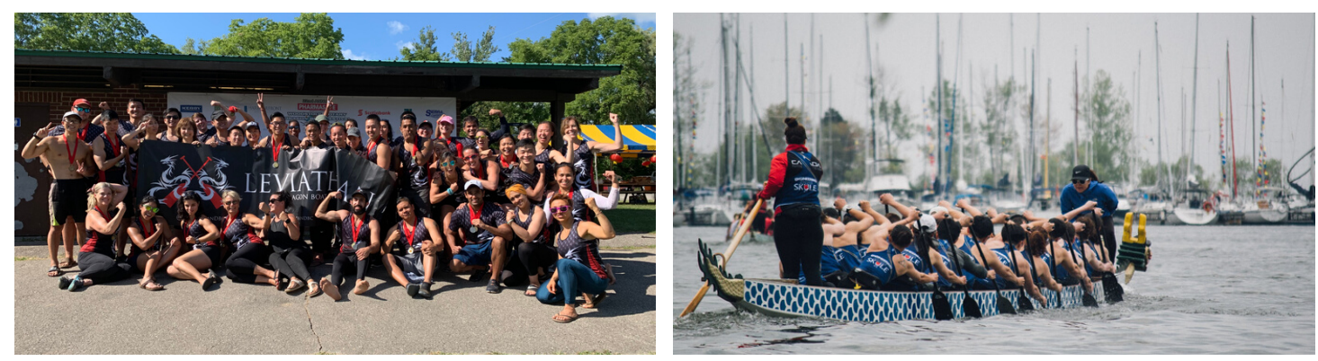
Leviathan Team.

University of Toronto (U of T) Iron Dragons: U of T Iron Dragons was formed in 1997 to introduce the exciting sport of dragon boat to the Skule<sup>™</sup> community. The main focus of the club is to encourage a healthy lifestyle for engineering students. It provides an environment that builds teamwork, communication, and friendship that reaches far beyond the edges of dragon boating. The team is mainly comprised of U of T engineering students, but students of all programs and faculties are welcomed. They are also primarily managed by engineering students and coached by engineering alumni.